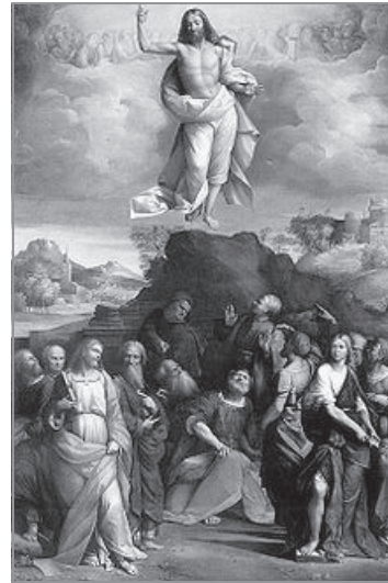
Ascension of Christ by Garofalo, 1520